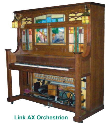
Link AX Orchestrion