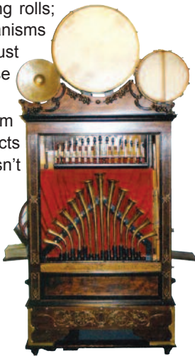
Wurlitzer Band Organ

Annual conventions are sponsored by local chapters to highlight their region. This meeting gives members the chance to enjoy collections, see historic sites and allows attendees to meet collectors from other areas. These events are hosted by enthusiastic chapter members who share an interest in automatic musical instruments. Informative workshops are presented as well as a mart where members may buy and sell rolls and other items related to automatic musical instruments.