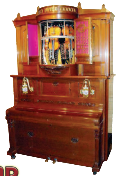
Hupfeld Phonoliszt Violina Style B