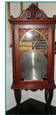
Regina 20 1/4" disc music box Changer

Local Chapters form a network across the country. These chapters meet regularly and offer social and technical interchange.